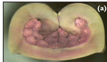
Significant flash can be generated with excessive anvil to crimper clearance, as shown by nominal design condition (a) and +0.003 in over nominal condition (b)

This more than a 50% increase in the nominal design clearance, which can result in unacceptable flash (see right). Dimensional control is clearly critical.